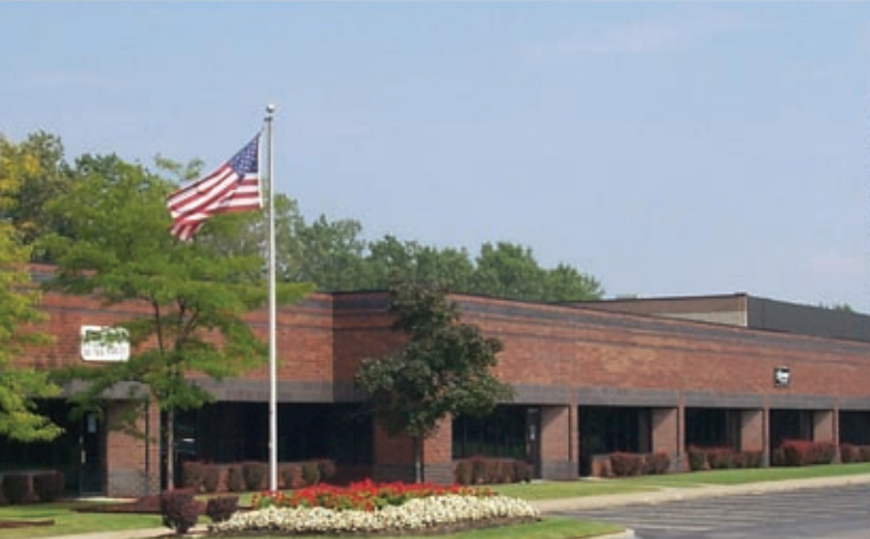
... Brooklyn Heights Business Centre I 950 Keynote Cir., Brooklyn Heights, Ohio