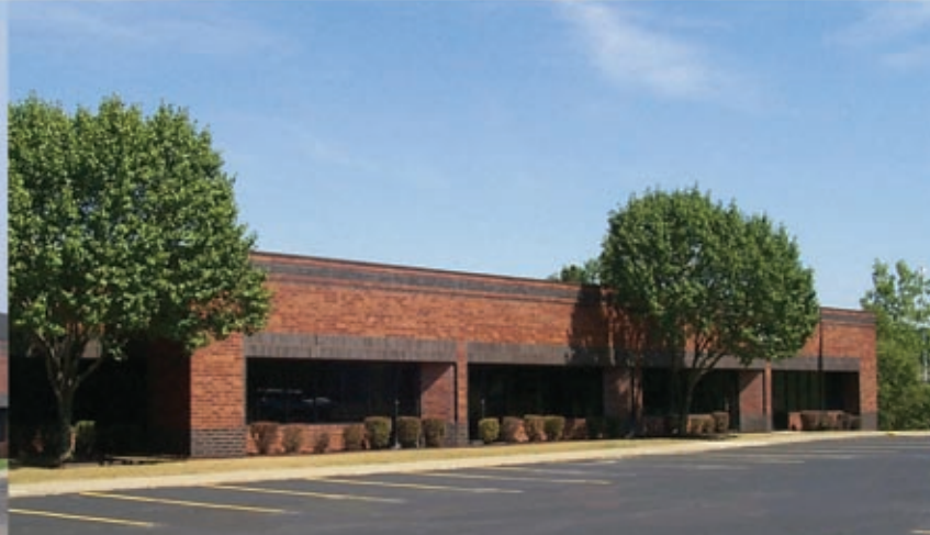
... Brooklyn Heights Business Centre II & III 1100 & 1200 Resource Dr., Brooklyn Heights, Ohio

“Flexible Spaces in All the Right Places” is what Fogg had in mind when designing their large portfolio of office, industrial and office/warehouse (flex) properties. Strategically located near major freeways in northeast Ohio, Fogg’s properties offer flexible floor plans, truck access and lease terms, as well as expansion opportunities for their growing customers.