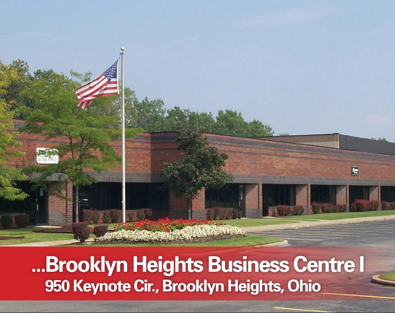
...Brooklyn Heights Business Centre I 950 Keynote Cir., Brooklyn Heights, Ohio