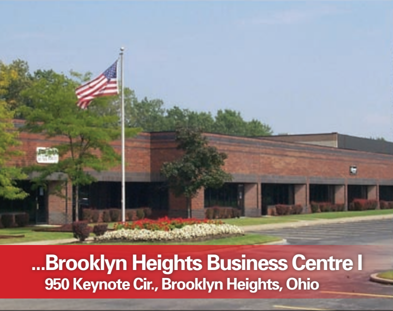
... Brooklyn Heights Business Centre I 950 Keynote Cir., Brooklyn Heights, Ohio