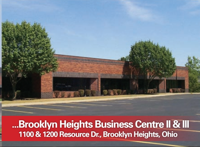
... Brooklyn Heights Business Centre II & III 1100 & 1200 Resource Dr., Brooklyn Heights, Ohio

“Flexible Spaces in All the Right Places” is what Fogg had in mind when designing their large portfolio of office, industrial and office/warehouse (flex) properties. Strategically located near major freeways in northeast Ohio, Fogg’s properties offer flexible floor plans, truck access and lease terms, as well as expansion opportunities for their growing customers.