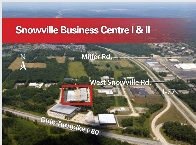
Snowville Business Centre I & II