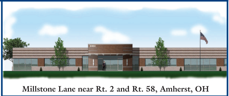
Millstone Lane near Rt. 2 and Rt. 58, Amherst, OH