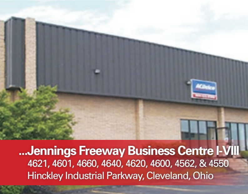
...Jennings Freeway Business Centre I-VIII 4621, 4601, 4660, 4640, 4620, 4600, 4562, & 4550 Hinckley Industrial Parkway, Cleveland, Ohio