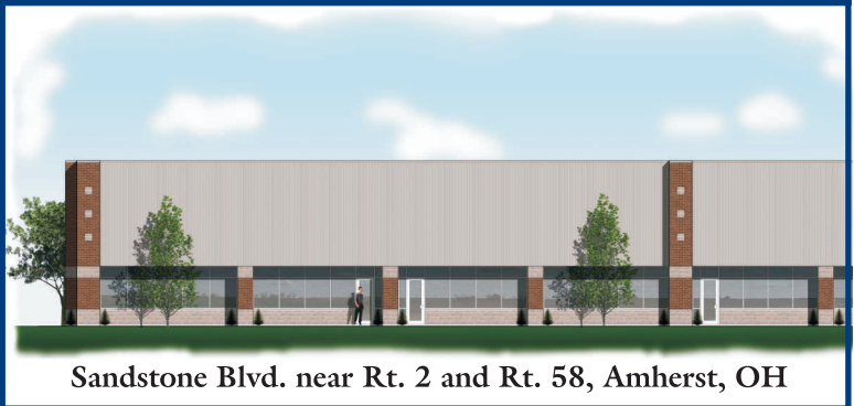
Sandstone Blvd. near Rt. 2 and Rt. 58, Amherst, OH